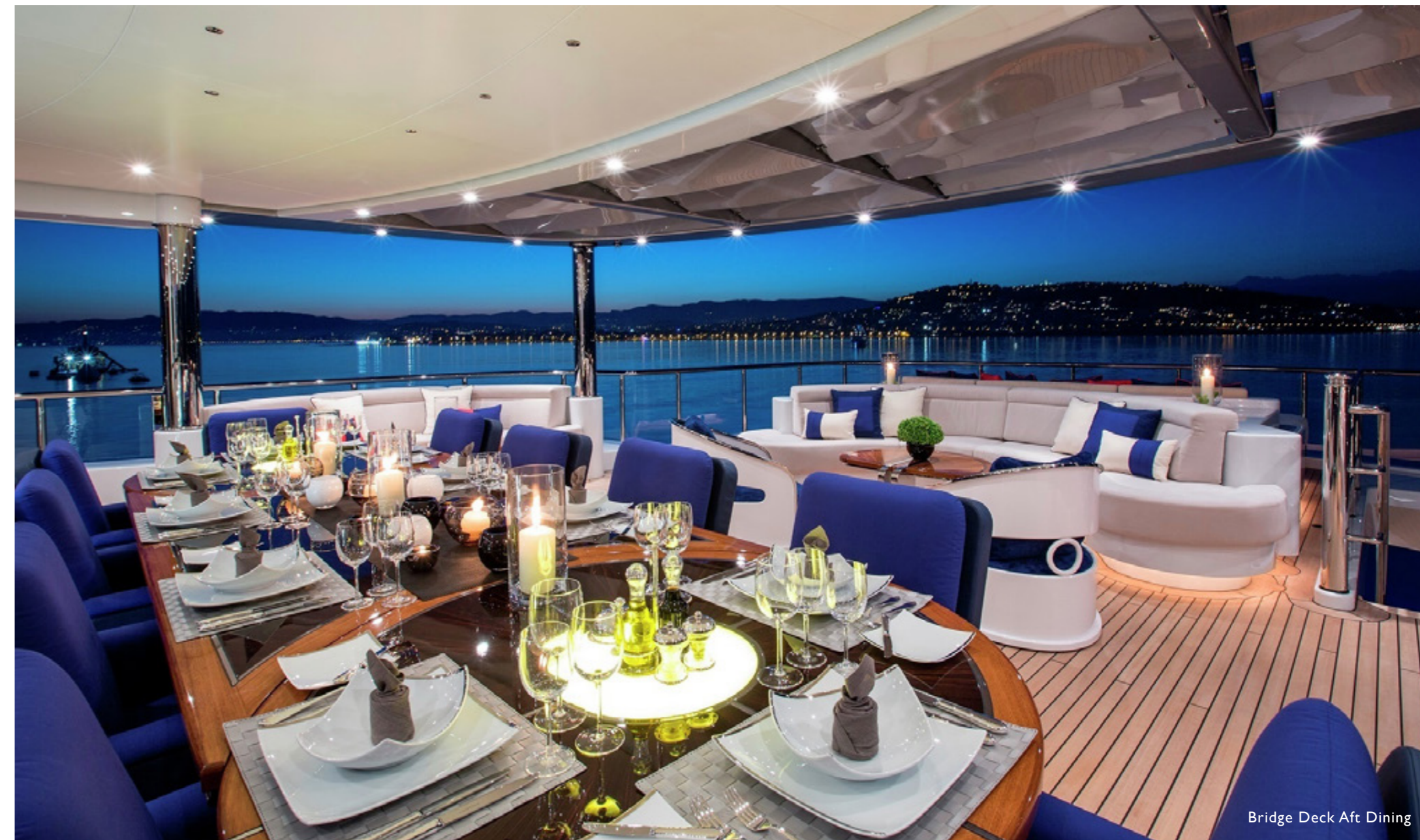
Bridge Deck Aft Dining