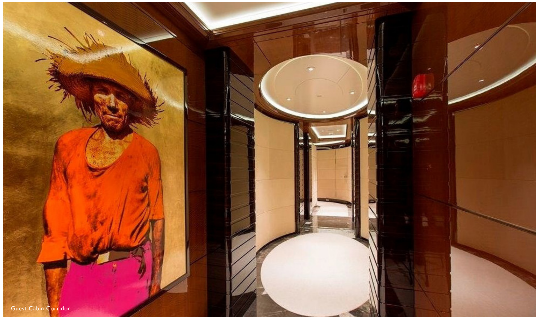
Guest Cabin Corridor