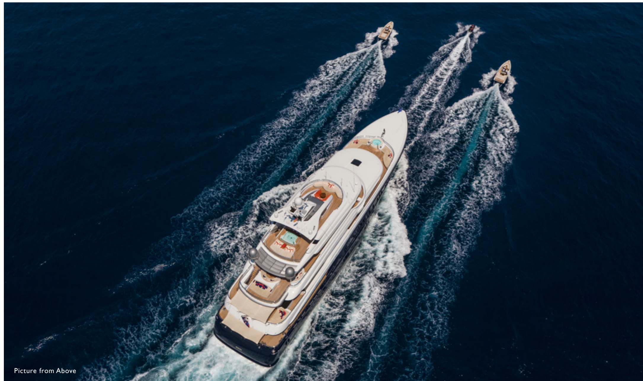
Picture from Above