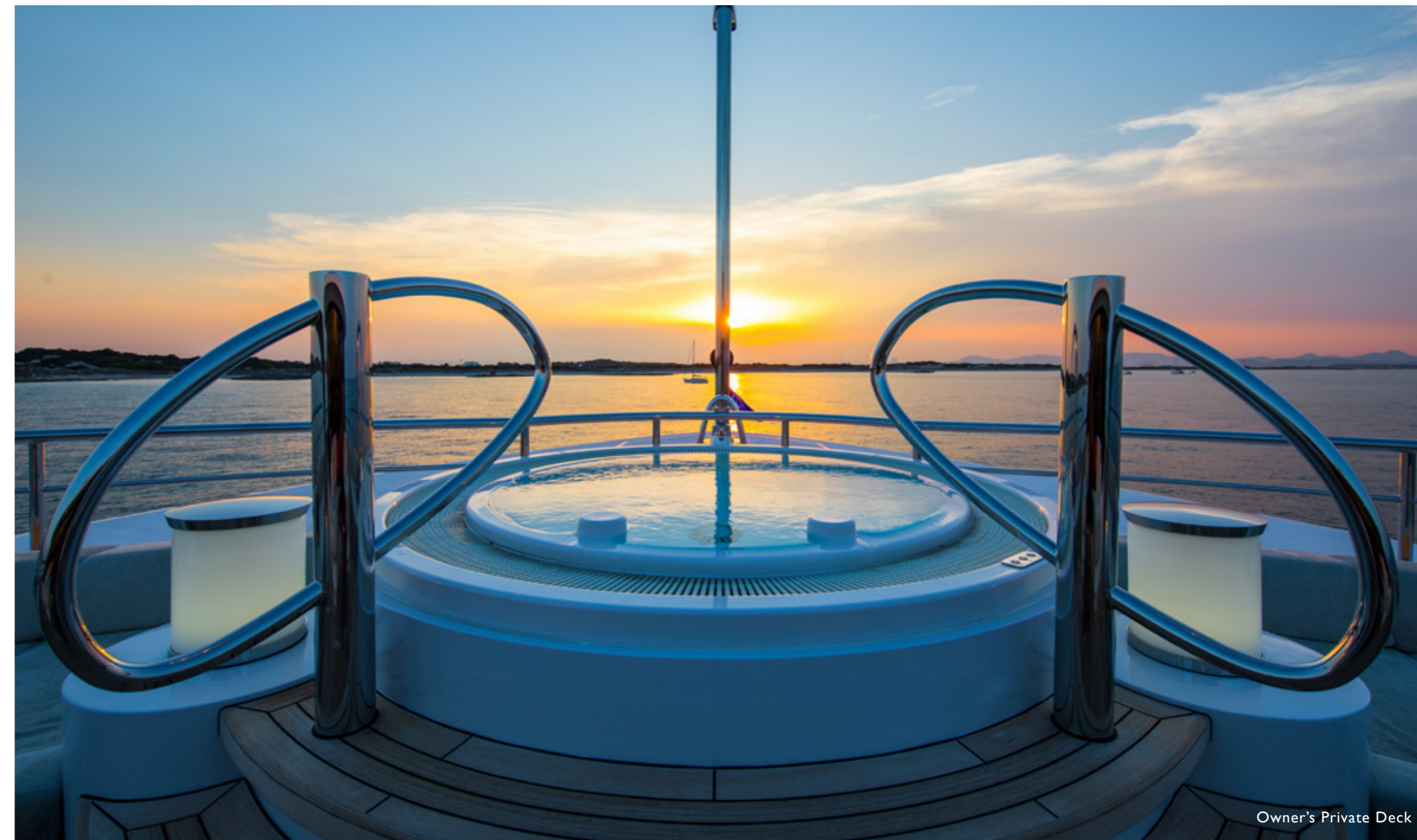
Owner's Private Deck