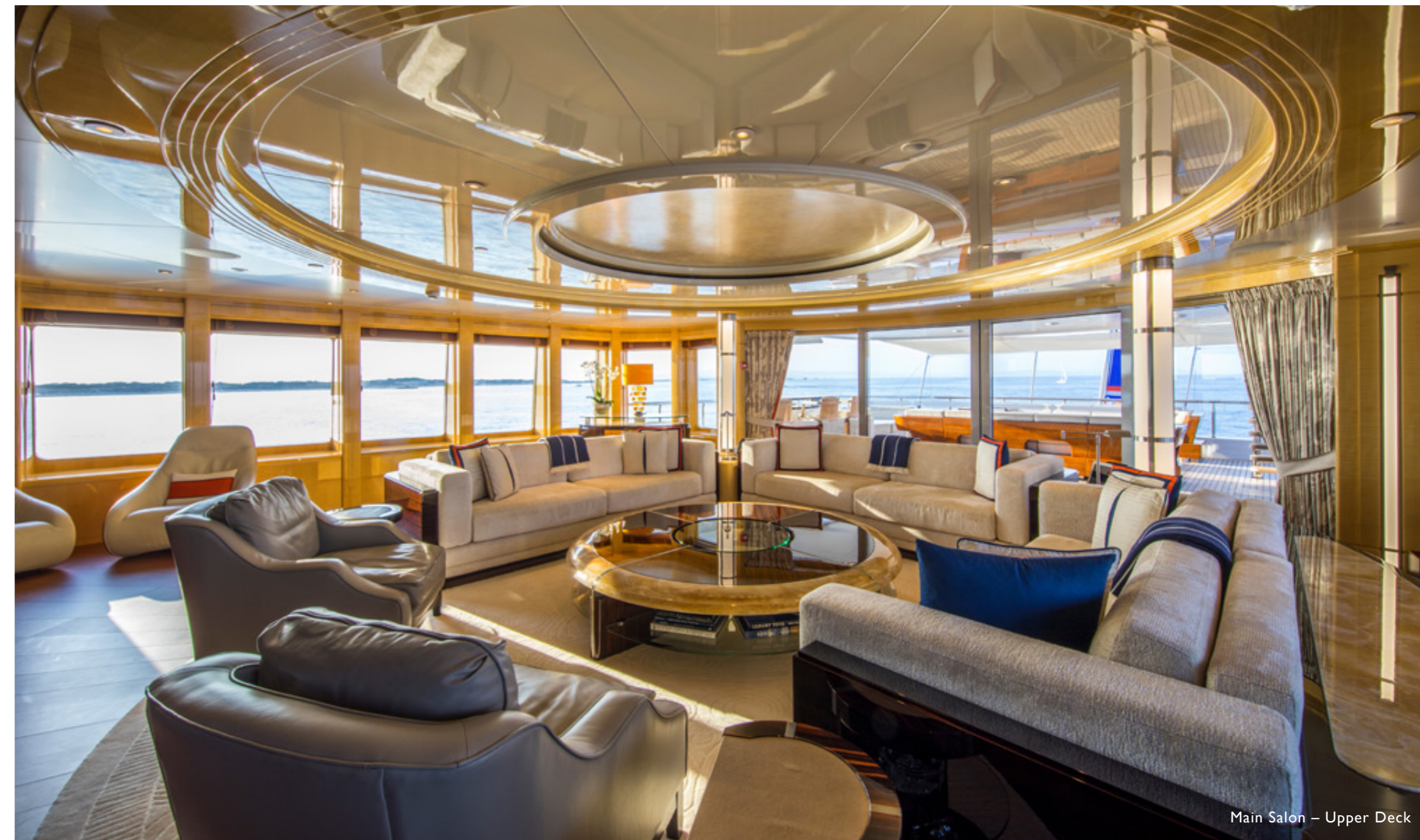
Main Salon – Upper Deck