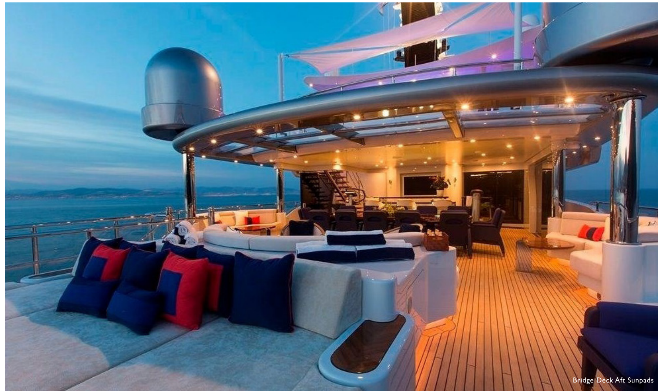
Bridge Deck Aft Sunpads