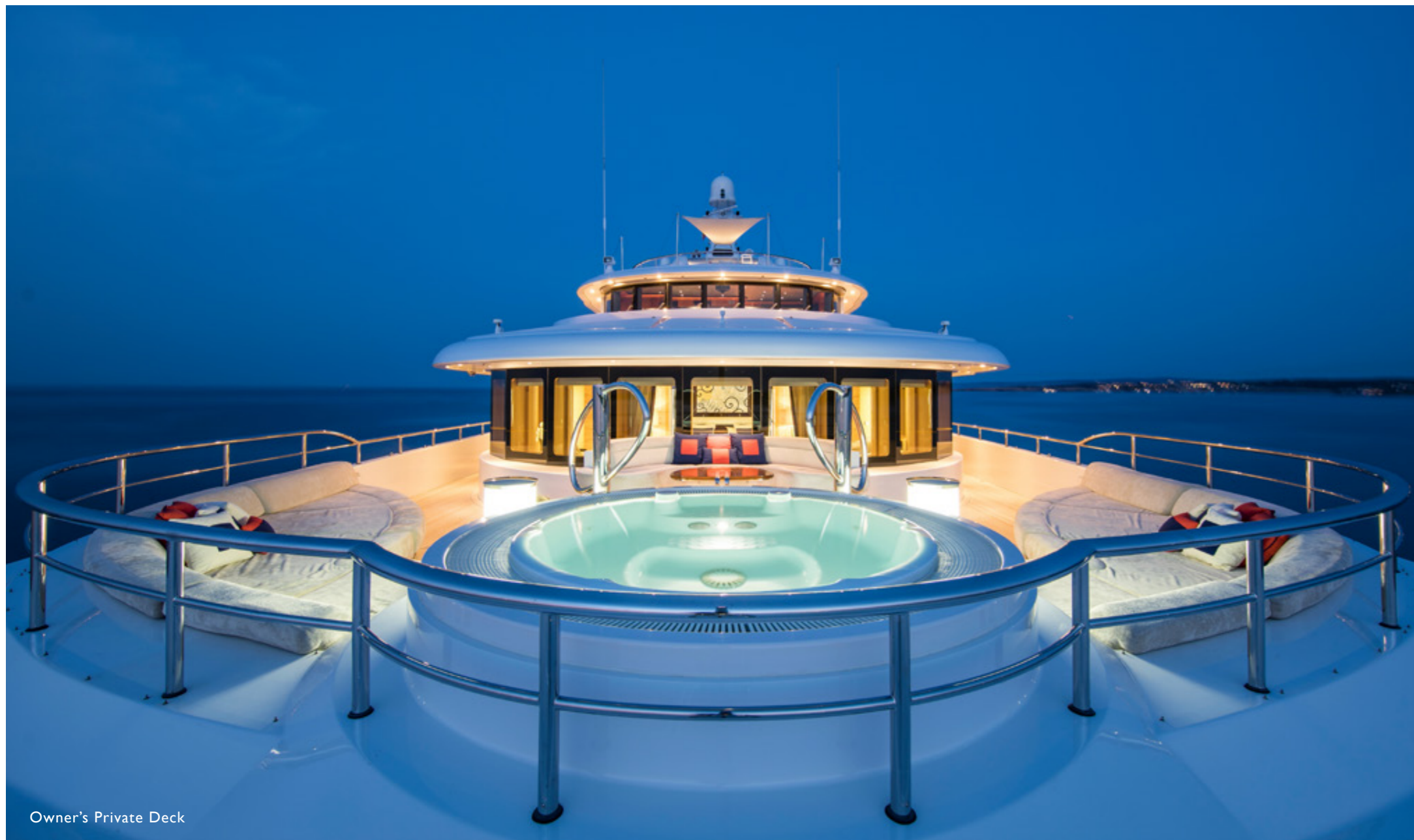
Owner's Private Deck