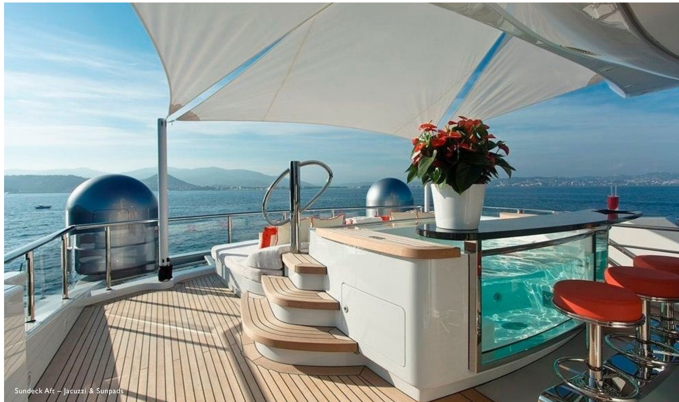
Sundeck Aft – Jacuzzi & Sunpads