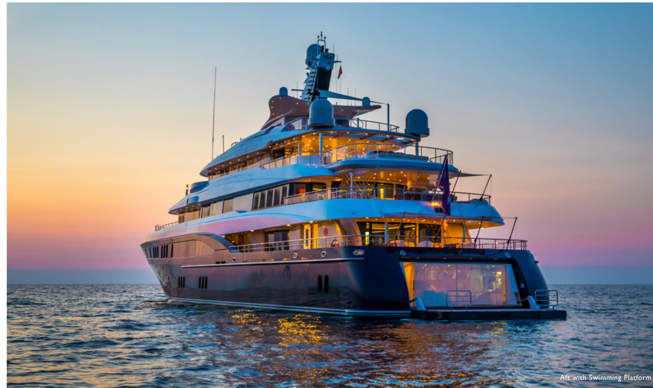
Aft with Swimming Platform

LOA: 60.92m BUILDER: Abeking & Rasmussen YEAR BUILT: 2012