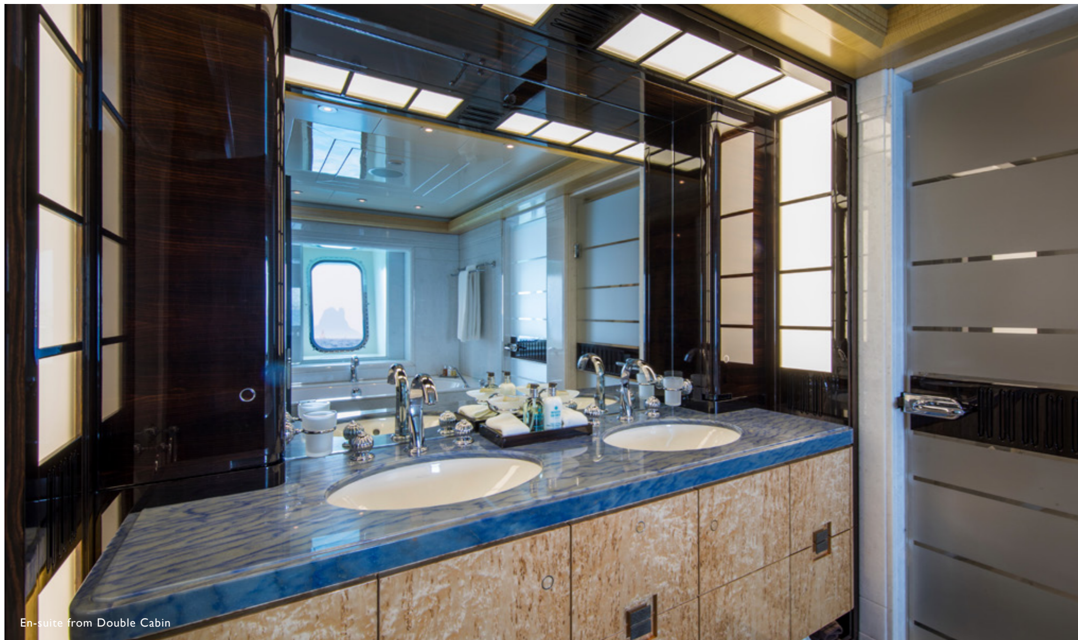
En-suite from Double Cabin