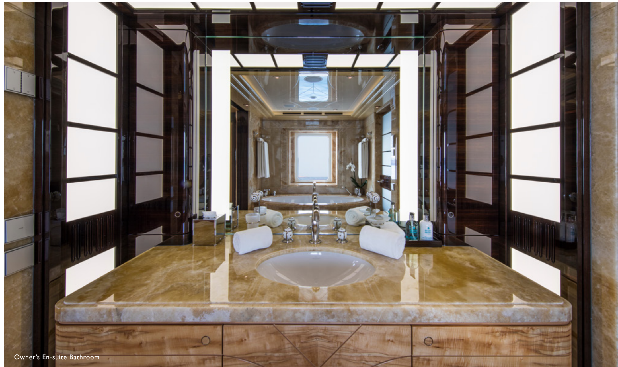
Owner's En-suite Bathroom