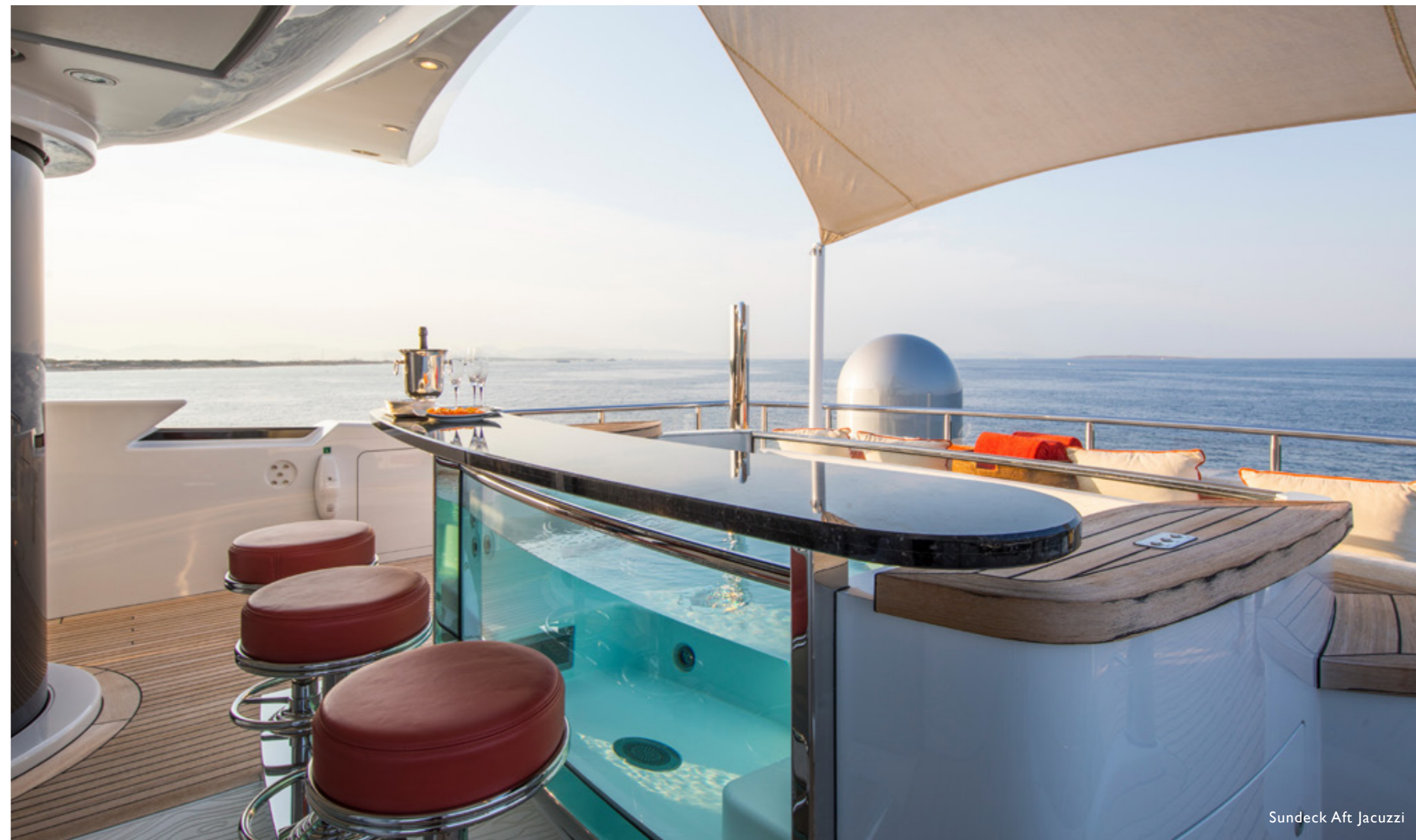
Sundeck Aft Jacuzzi