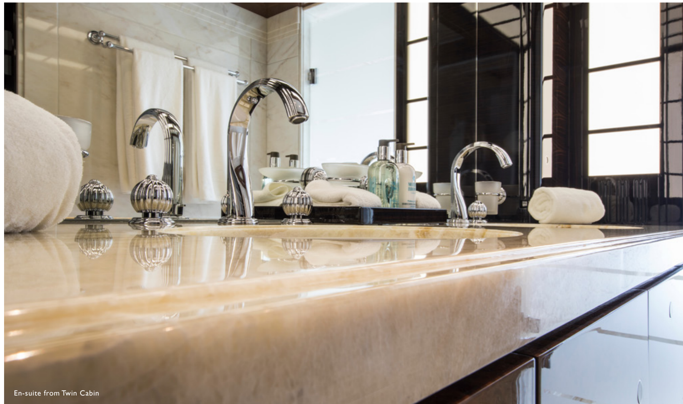
En-suite from Twin Cabin