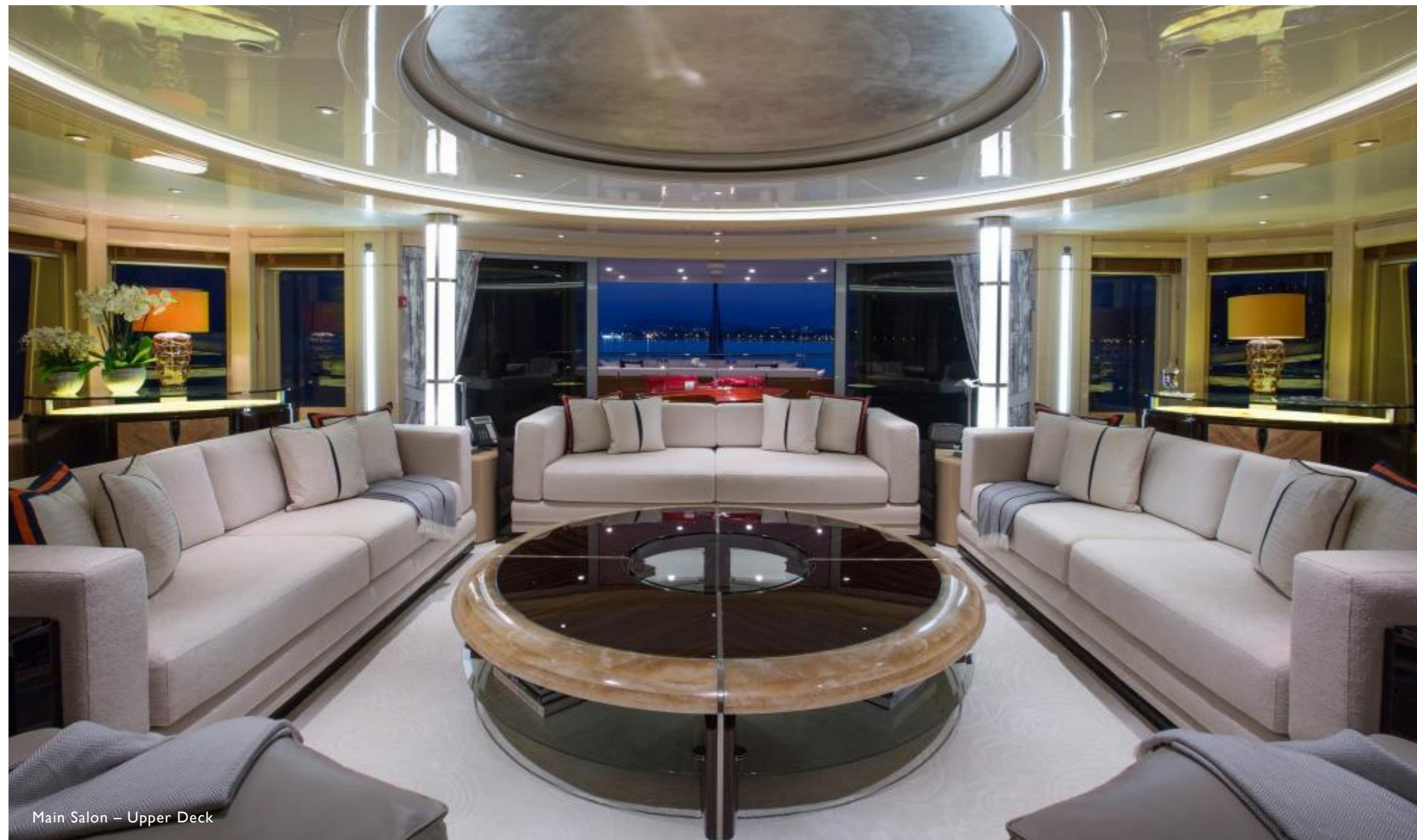
Main Salon – Upper Deck