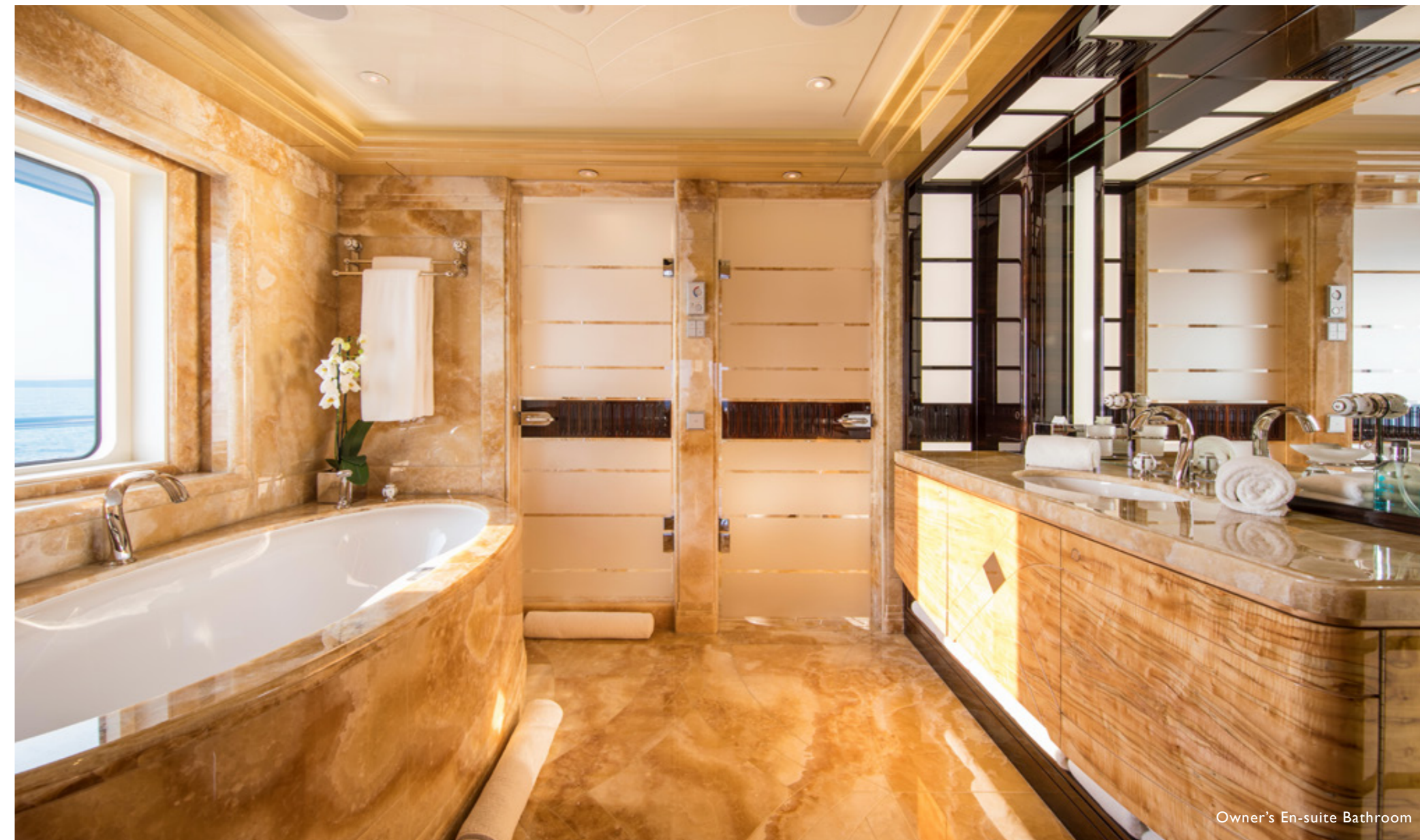
Owner's En-suite Bathroom