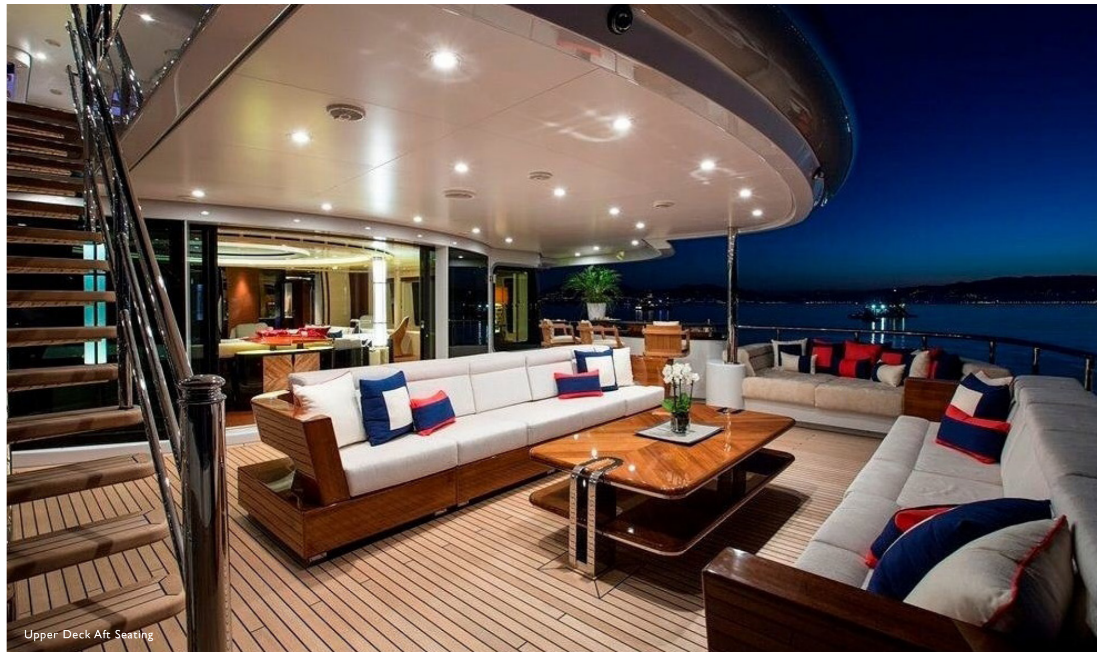
Upper Deck Aft Seating