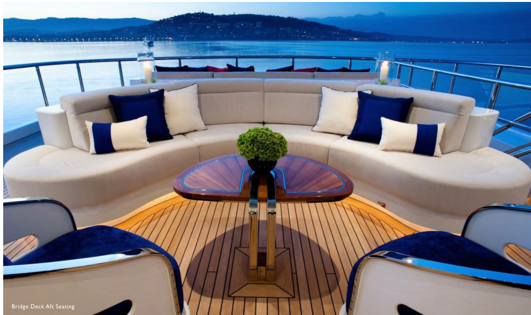
Bridge Deck Aft Seating