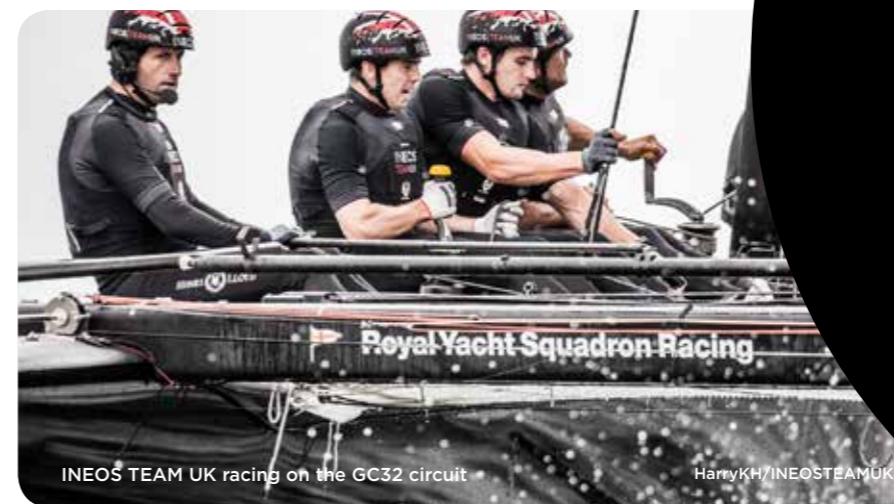
INEOS TEAM UK racing on the GC32 circuit

The America's Cup is a sailing race that consistently pushes the boundaries of design and technology. Tradition states that the reigning champion decides the concept and parameters of the race to defend their title. Emirates Team New Zealand and Challenger of Record, Luna Rossa Challenge, have chosen the AC75, a 75-foot high performance fully foiling monohull. Since the teams received the AC75 class rule back in 2018 – a rule which defines the parameters within which teams can design a yacht eligible to compete in the 36th America's Cup – they have been working hard behind closed doors to design and build their race boats.